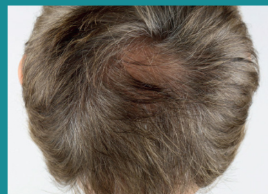
AFTER 12 WEEKS