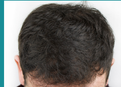
AFTER 12 WEEKS

PATIENT RESULTS OBTAINED WITH HAIR MICRONEEDLING TREATMENTS