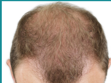
AFTER 12 WEEKS

PATIENT RESULTS OBTAINED WITH HAIR MICRONEEDLING TREATMENTS