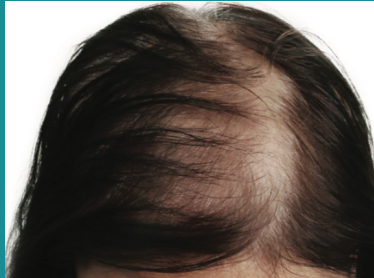
AFTER 8 WEEKS

PATIENT RESULTS OBTAINED WITH HAIR MICRONEEDLING TREATMENTS